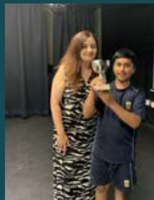
House Cup - Bradford