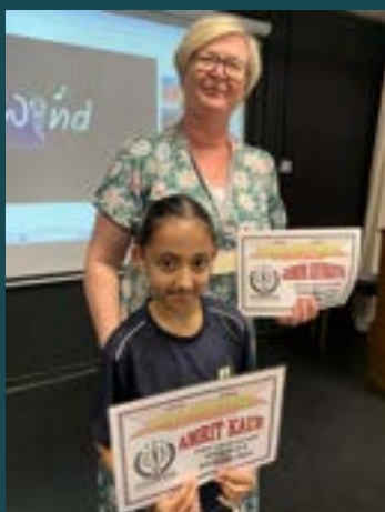
Hall of Fame Award