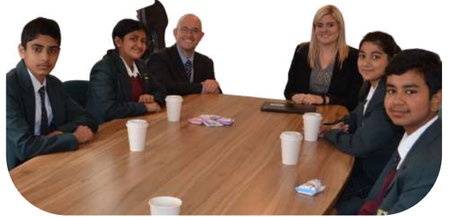
Senior School pupils of the week: