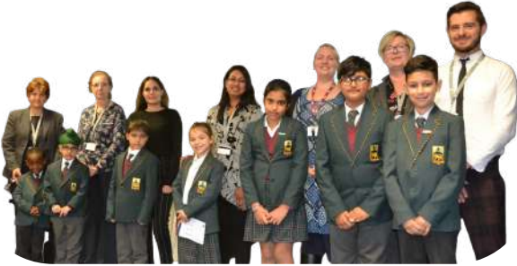
Prep School stars of the week: