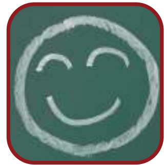
YEAR 6 STAR OF THE WEEK: COMING NEXT WEEK