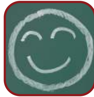
RECEPTION STAR OF THE WEEK: COMING NEXT WEEK