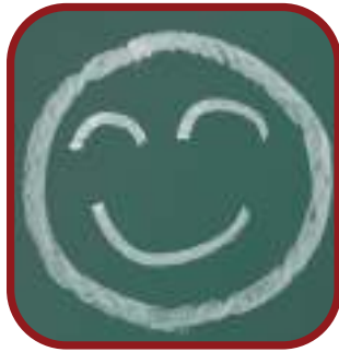
NURSERY STAR OF THE WEEK: COMING NEXT WEEK

Congratulations to the following pupils who have received a Head's Commendation for excellence in the classroom this week: