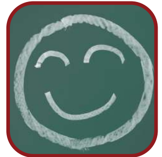
YEAR 6 STAR OF THE WEEK: COMING NEXT WEEK