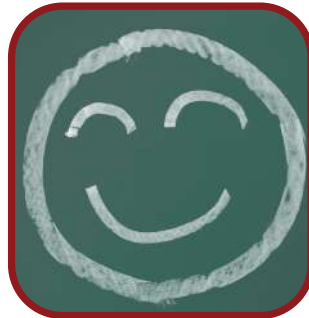
YEAR 5 STAR OF THE WEEK: COMING NEXT WEEK