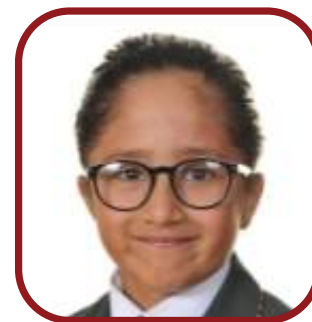
MUSIC PERFORMER OF THE WEEK: AVARAN (YEAR 5)